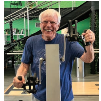
Benefitness Adaptive Gym offers members of all abilities the opportunity to reach their fitness potential.

Whether supporting older adults, guiding families, or teaching children empathy, Benevilla makes a lasting impact. Your support has been essential in continuing this mission of providing vital services that strengthen the community.