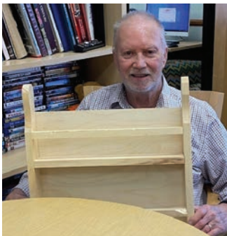
Mary’s Place member displays a woodworking project.

When life becomes overwhelming, finding the right support can make all the difference. That’s where the Benevilla C.A.R.E.S. (Community Assistance, Resources, Education & Support) department steps in. With a team of compassionate and highly trained resource coordinators, C.A.R.E.S. provides personalized guidance to seniors, families, and caregivers navigating complex challenges.