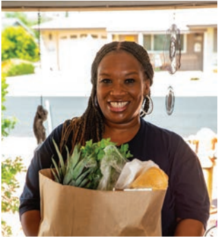
Home Services volunteer shops for and delivers groceries to homebound older adult.

The department doesn't just offer information—it extends a helping hand, ensuring individuals feel heard, understood, and supported. Whether through support groups, educational workshops, or one-on-one consultations, C.A.R.E.S. creates a sense of community and belonging, reminding people they are never alone in their journey