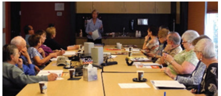
Community members attend free Benevilla workshop.