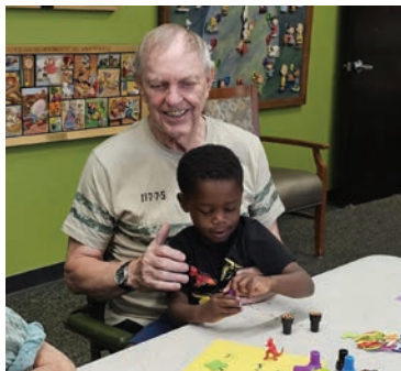
Lucy Anne’s Place member and Wirtzie’s preschooler enjoy an intergenerational activity.