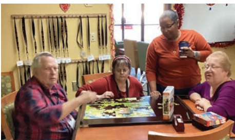
West Valley members work together on a puzzle.